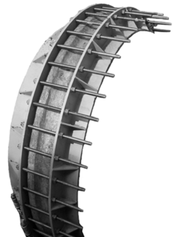
JCM 143 - 14" - 72" Larger sizes available