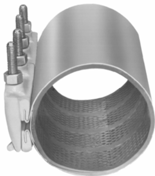
JCM 121 Gas Repair Clamp Image reflects 12" width

All full circumferential single band repair clamps 10" and larger shall have a minimum material of 17 gauge certifiable prime 304 Stainless Steel band; heavy duty ductile iron lugs per ASTM A536 with mutually supporting sliding fingers; 3/4" corrosion resistant alloy bolts, per ASTM A242/ANSI 21.11/AWWA C-111, and a 1/4" thick Nitrile Butadiene Rubber (NBR, Buna-N) gridded gasket with tapered stainless steel bridge plate molded flush into the gasket. To provide extra tightening capability, the band shall be permanently attached to the lugs. The attachment shall withstand a minimum of 100 ft. lbs. of torque per bolt. Clamp shall be similar to JCM 121 Gas Repair Clamp or approved equal. Optional features available; see material specification.