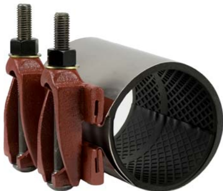
JCM 171 Universal Clamp Coupling Image reflects 6" width

JCM 100 Series Universal Clamp Couplings are ANSI/NSF Standard 61 and Standard 61 Annex G Certified. JCM 100 Series Universal Clamp Couplings meet or exceed ANSI/AWWA C230 Standard for Stainless –Steel Full-Encirclement Repair and Service Connection Clamps as applicable.