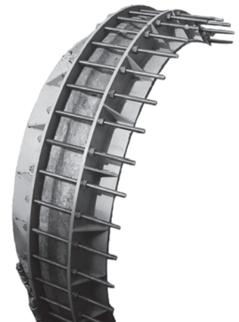
JCM 143 - 14" - 72" Larger sizes available

JCM 143 Bell Joint Leak Clamp 14" and Larger - Fabricated Steel